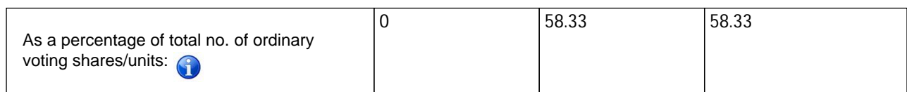
Table 3. Change in respect of rights/options/warrants over shares/units of Listed Issuer